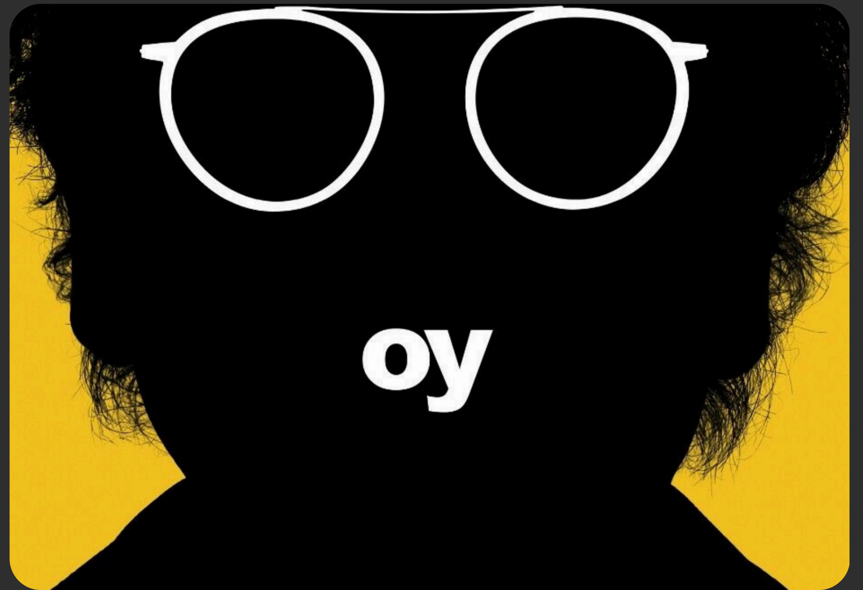
CURB YOUR ENTHUSIAM (HBO)